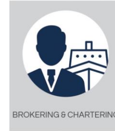
BROKERING & CHARTERING